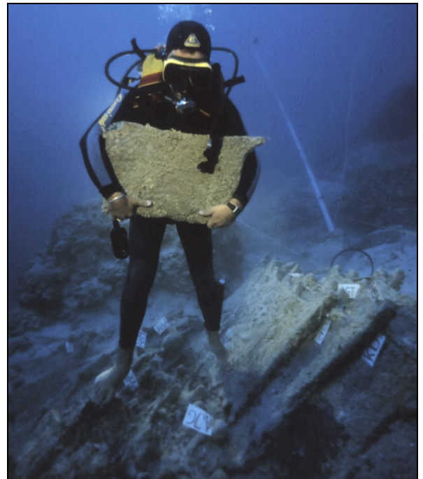
Picture of a diver with an oxhide metal ingot

As I stated beforehand, this wreck is actually quite rich and holds the single largest deposit of Bronze Age metal ingots. These ingots were the main cargo of the ship and took up 11 of the assumed 20 tons of space available. 10 of these 11 tons were copper ingots, with the other ton being tin. The majority of the copper ingots (317 of 348) were shaped in the typical way, having a protrusion at each corner, which is called an oxhide shape. The rest were unique, having only two protrusions.