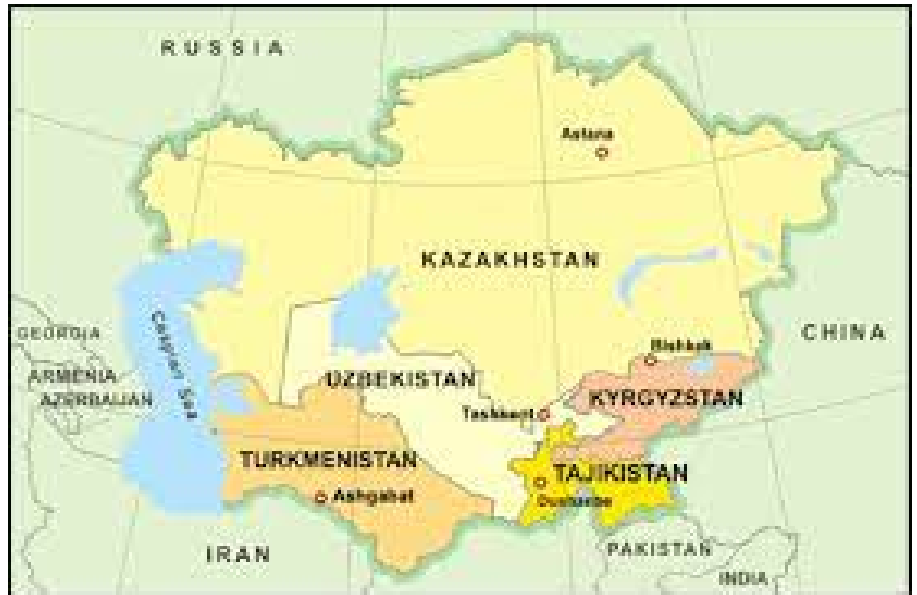
A map showing Central Asia, with Uzbekistan and Tajikistan in the south

A new study has narrowed this down even further, not only getting the exact mines for the source in Central Asia, but also providing insight into the trade relationship between the miners and the people who bought the tin. The way that these researchers figured this out was through lead and tin isotope analysis to match the tin to the source mine.