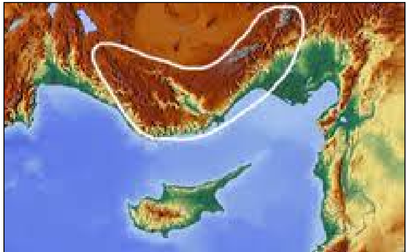
A map outlining the Taurus Mountains with Cyprus to the South

Compared to the copper, the tin from the wreck was sourced from a wide geographic region. The copper likely came from northwestern Cyprus, but the tin has a more complex story. Originally, it was believed to be from the general area of the Middle East and Near Asia, with further testing narrowing that down to the Taurus Mountains in Turkey and some sources in Central Asia.