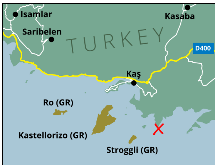
Map of the surrounding area and the wreck site

I know that I just said that most archaeology isn't focused on shiny things, and it isn't, but the Uluburun shipwreck is in fact one richest, meaning most valuable, assemblages of Bronze Age trade goods ever found. But, it isn't the riches that interest me (too much), but rather what the ship's contents could mean in the larger context of the Late Bronze Age (approx. 1,550-1,200 BCE) world.